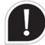
table. Final date for reservations 23rd November. Help needed – please see separate blue flyer.

Saturday, 2nd December. Invitations are on the Welcomers